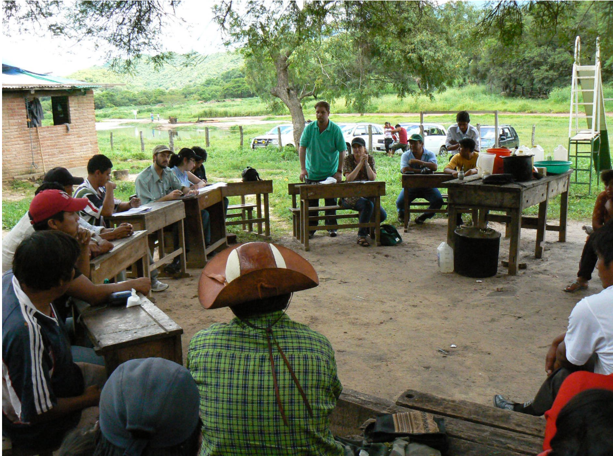
Members of the international fact-finding mission met with families and village associations in isolated communities to learn how social and agricultural support programs in the area have improved sustainable access to adequate food.