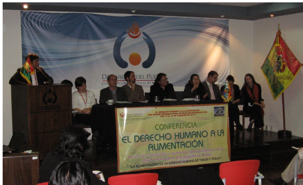
The delegation presents preliminary findings during a public seminar held at the Defensoria del Pueblo on February 14, 2011.

Following the presentations, a lively discussion took place among seminar participants regarding the appropriate role of the state in national food production, and the challenges of ensuring state accountability for right to food violations.