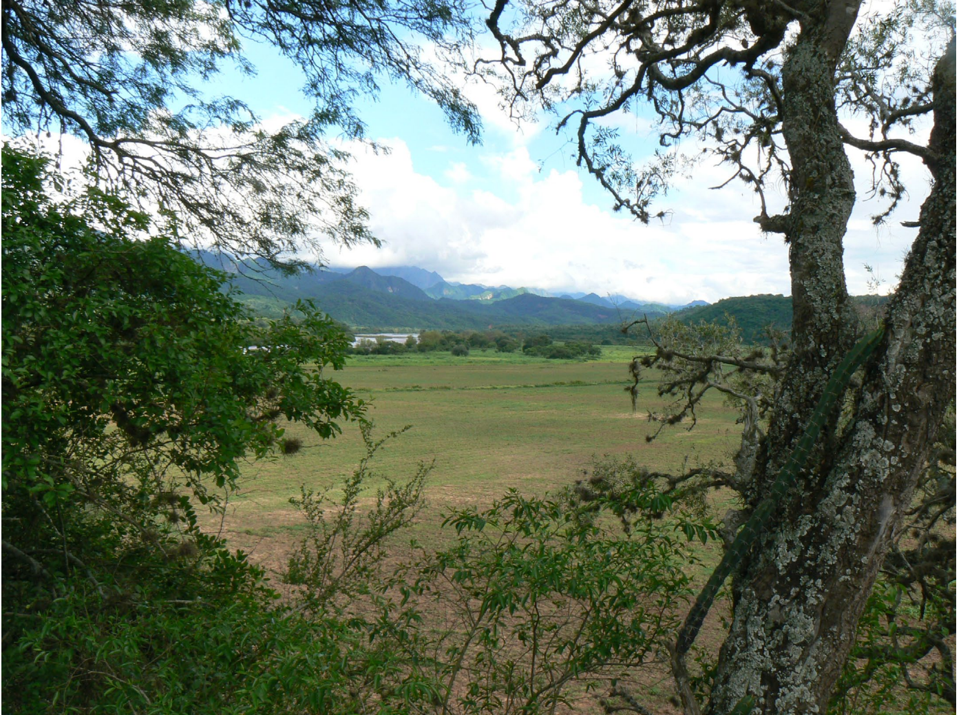
The international fact-finding mission travelled to Bolivia from February 5-14, 2011 to assess hunger and food insecurity from a human rights perspective and recommend strategies to help eradicate hunger.